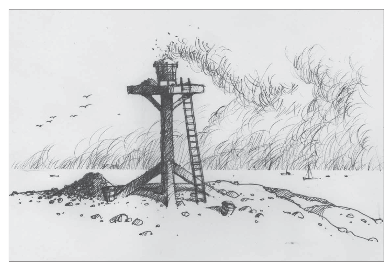
ABOVE AND BELOW: Impressions of early Aids to Navigation of the Medieval period.